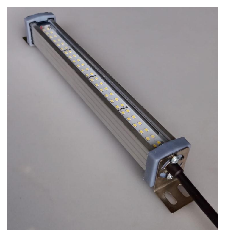
Image only for representative purpose The LED light is available in standard version and can be customized to size and wattage as per customer for specific application