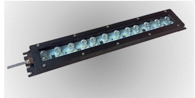
Image with Light Bracket, can also be installed without bracket.

2 Core wire, 0.5 Sq. mm, 2 Mtr Lengths, RED- Positive, BLACK - Negative