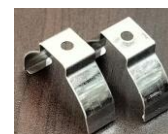
Steel Mounting Clamps